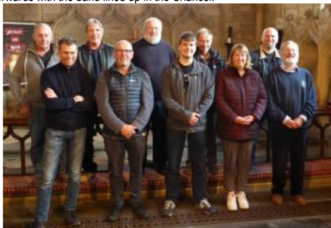
Band clockwise from treble at front right.