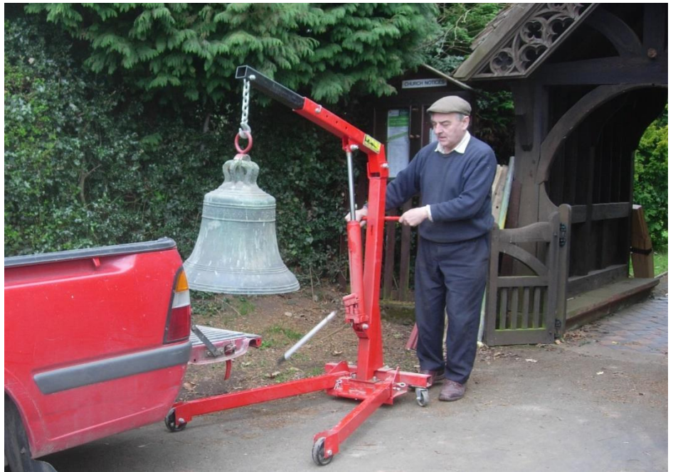
The single bell at Little Witley (Worcs) at 24 inches in diameter was comfortably transported into the church on the 31 st March 2009. It was cast by Richard Sanders of Bromsgrove in 1733.

Following on from Tales (16) I recall the predicament which arose at Stanton (Glos) when the ring of 6 bells there were rehung in a new metal frame in 2006 – the ringing room / vestry at the base of the tower had two (2) doorways serving direct access from either outside or, as usual, into the main body of the church. The bells had to be despatched to the bellfoundry but unfortunately the 11 cwt tenor diameter was some 2 or 3 inches greater than the internal (larger) doorway width. A practical solution was to carefully remove the supporting stonework at the foot of the doorway to allow the lip of the bell through but that in itself presented a further problem – how to move the bell through the doorway as to have placed the bell on a conventional wheeled trolley would have required most of the doorway stone to be removed!. Investment in a 1 tonne capacity folding workshop crane allowed the bell to be inched forward through the available gap. My accompanying photograph shows the apparatus employed on another project. Roger de 'Flaedenburg'